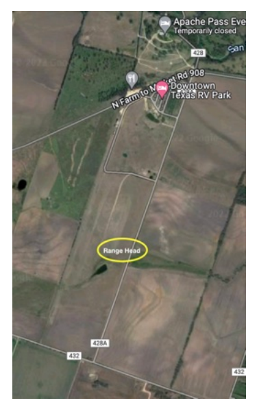
Overview of flying site

The primary housing location for competitors and team supporters will be in student housing located on the campus of Southwestern University in Georgetown, Texas, approximately 34 miles (55km) from the flying site. Cafeteria-style breakfast and dinner choices will be available for participants who choose this housing option. Participants who prefer more traditional hotel arrangements will have the opportunity to choose from many options offering a wide range of amenities and prices.